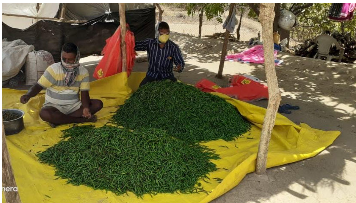
Farmers engaged in grading and packing the green chilies

chili, during the early days of the lockdown, as export operations were restricted. The entire nation has been under lockdown since the last week of March 2020, but fortunately, the markets for agriculture commodities were allowed to function with strict guidelines to maintain social distancing and hygiene at market yards.