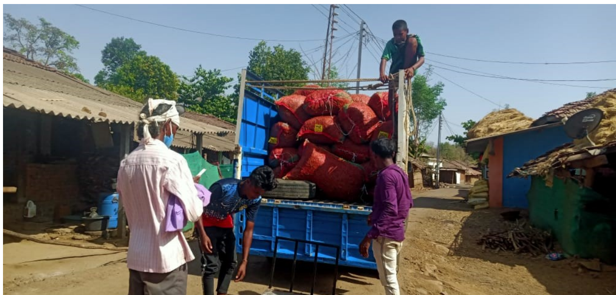
Loading green chilis to market