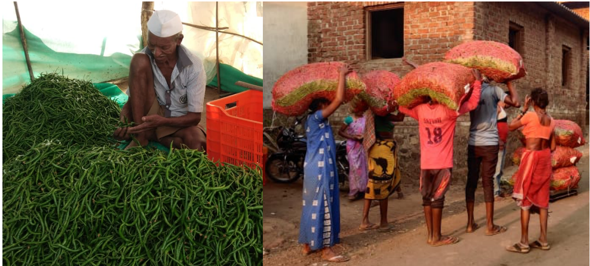
Family members engaged in grading, packing, and dispatching the green chilies to market