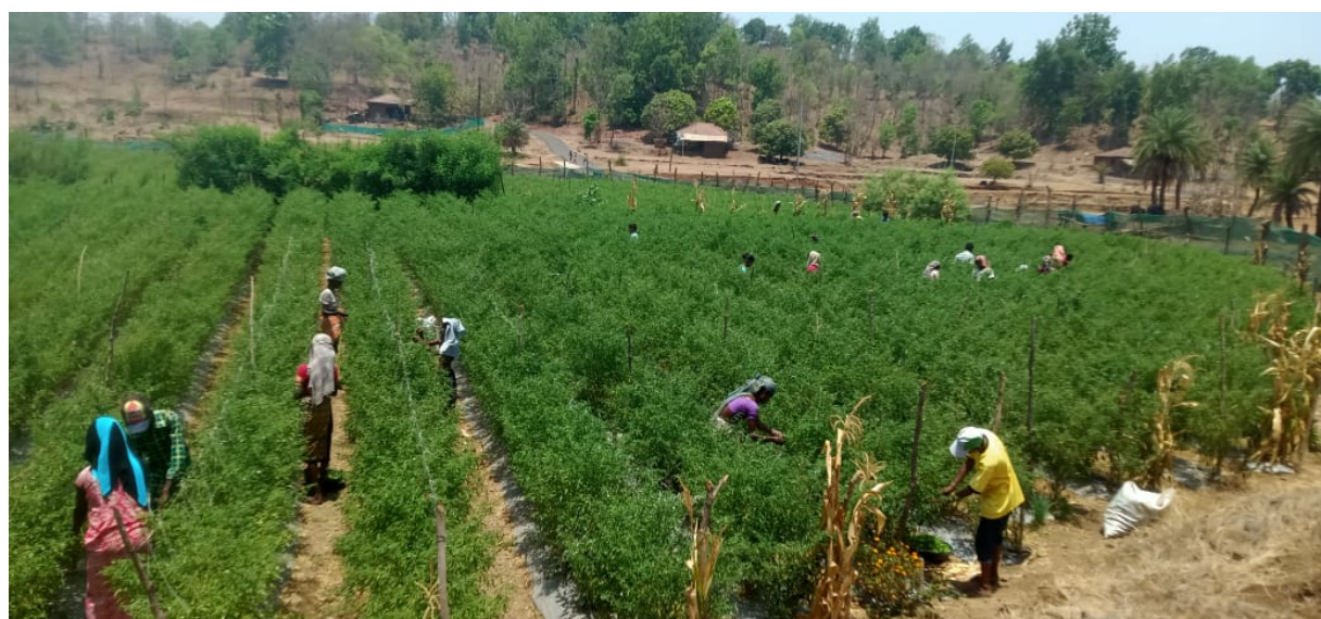
Green chili harvesting at farmers' fields

Maharashtra State in India, has been reeling under the impact of the COVID-19 pandemic for the last two months. The economy of the State, known for its agrarian workforce and bustling markets, has come to a virtual standstill ever since the national lockdown was imposed from 24 March 2020. With a large-scale economic setback looming large, the State's agriculture and allied sectors have also taken a beating. The Government of India has been working extremely hard to ease the suffering faced by farmers and have granted exemption to movement of farm produce during the lockdown. Many other organizations across India have also pitched in. In this blog, we focus on how the International Crops Research Institute for the Semi-Arid Tropics (ICRISAT) and JSW Foundation have been helping chili farmers cope with marketing of their produce in view of COVID-19.